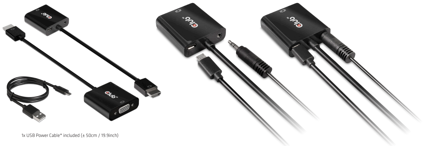
1x USB Power Cable* included (± 50cm / 19.9inch)

* Besides, if the HDMI source display can't supply enough power, you can connect a power adapter or computer to the Micro USB female port to supply power for the adapter.