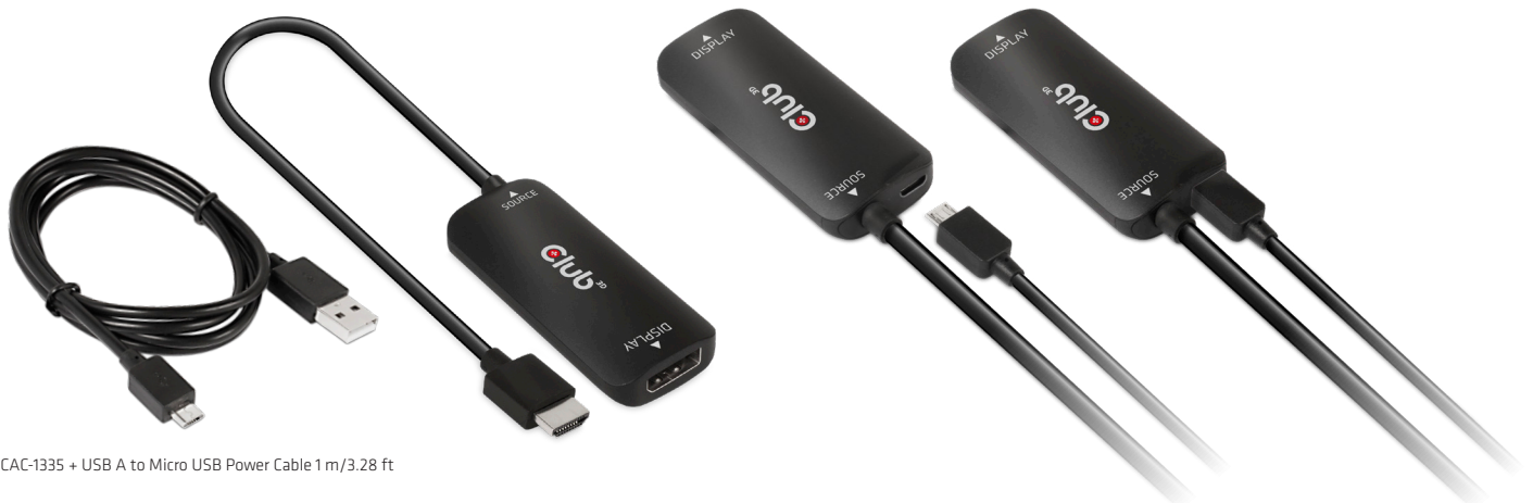
CAC-1335 + USB A to Micro USB Power Cable 1 m/3.28 ft

** Connect a power adapter or computer to the USB Type A plug to supply power for the adapter. Please check whether your external power source supports 5V / 1.5A (7.5W).